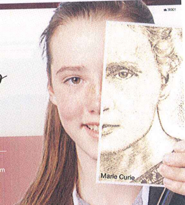
HUME LEADER, Tuesday, January 26, 2016 03

The Ridgeway Campus Wednesday 10 February 9.00am Years 7 to 12, VCE and International Baccalaureate